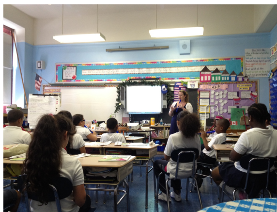
Picture 6 and 7: New York Philharmonics' teaching artists at work in Young Composer after school Program, and 5 th grade class in New York

Manhattan Theatre Club (MTC) 21 is a Broadway Theatre staging contemporary drama. From 1989, they have offered educational programs in close relationship with their theatrical productions. In the Core program, students attend a matinee of an MTC production after classroom preparation through four workshops with teaching artists and classroom teachers. In Write on the edge (WROTE) the students develop original scripts inspired by a Manhattan Theatre Club production they have studied and attended. This project culminates in a performance of the students' work performed by professional actors. Theatrelink is a web-based program where students in geographically isolated communities collaborate on a playwriting/production project. Classes at each site write an original play based on an MTC production, and students at a partner school produce their play. This program culminates in a streamed presentation of the plays. Manhattan Theatre club also work with theatre programs in prisons.