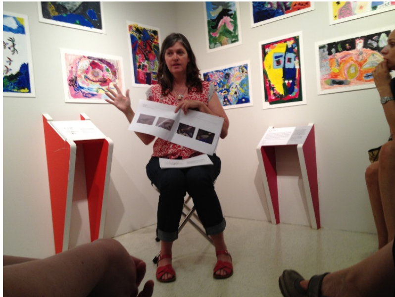
Picture 8: Teaching artist presenting student work exhibit at Guggenheim Museum

Guggenheim Museum 25 has used teaching artists from the 1970s. In the program Learning Through Art (LTA) the focus is on art explorations of a theme, such as for example the United States' history, "What are the traits of a good leader?", creativity, literacy, and problem-solving. Their teaching artists work in 20-weeks in-school residencies, examining, discussing, and creating works of art. The 1500 students involved in programs annually come to museum exhibitions three times as part of the program, and at the end of the year, selected student works exhibits in A Year with Children exhibition at the museum. Twelve teaching artists worked at Guggenheim Museum in 2012.