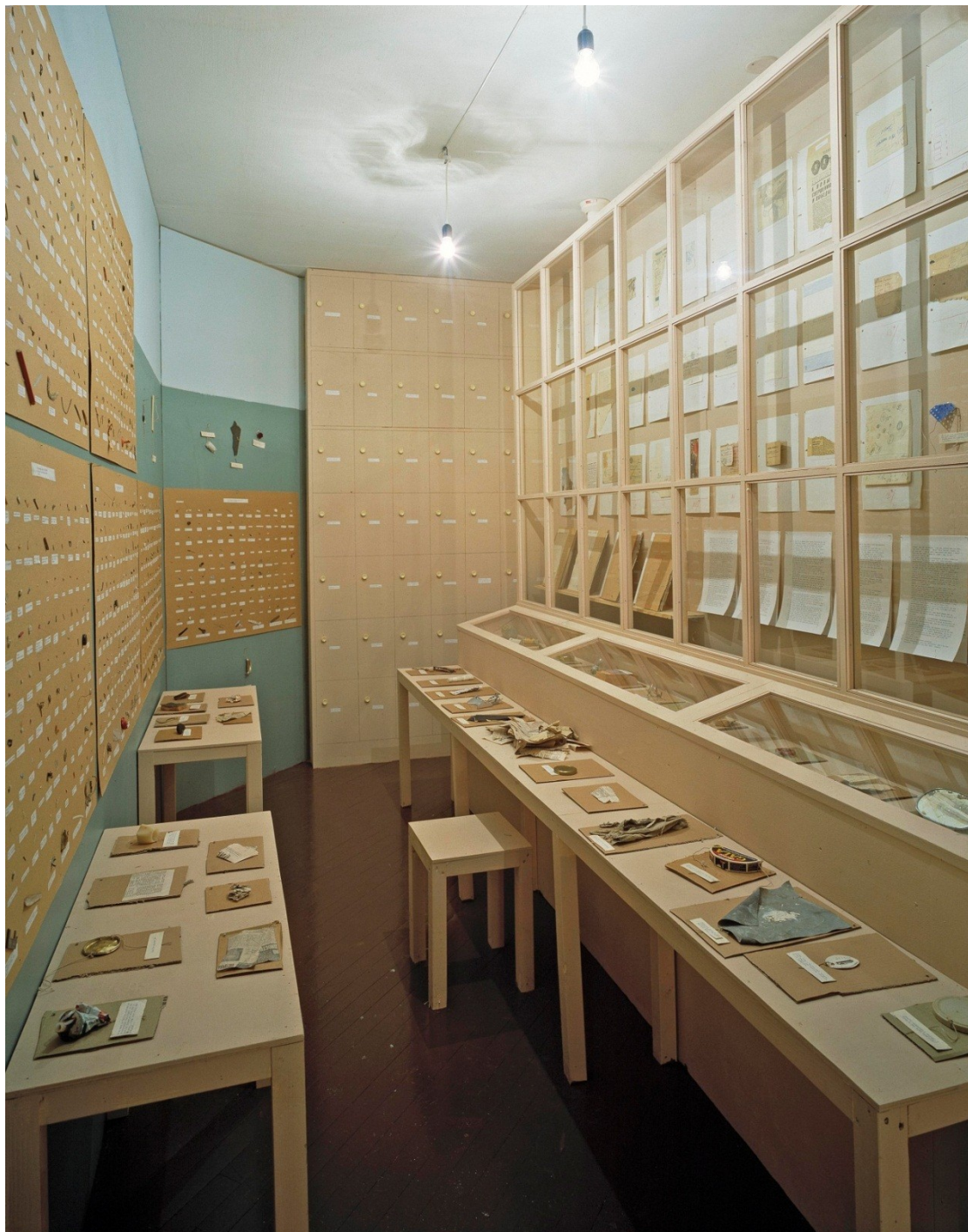
Figure 3. Ilya Kabakov, The Garbage Man (1995).

actual objects and leaves them untouched. Artists do not seem to be constrained by any such reverence. Their listing of things may resemble a scientific method, but in fact gives more the impression of a parody. 9 Perhaps even cultural researchers should sometimes dare to be more blasphemous and see what happens.