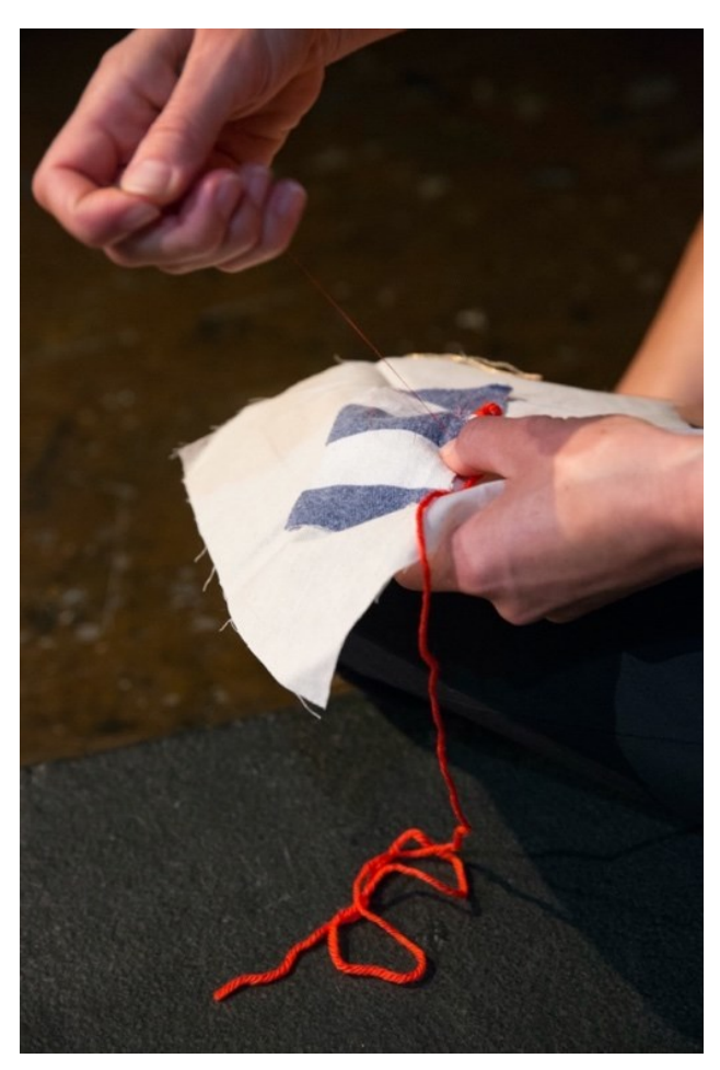
Figure 6. From the performance Childism (2015).

sewing, embroidering or knitting. In the performance, this became an activity without words, a pause to digest, reflect and sense what was not being said – the absent presences.