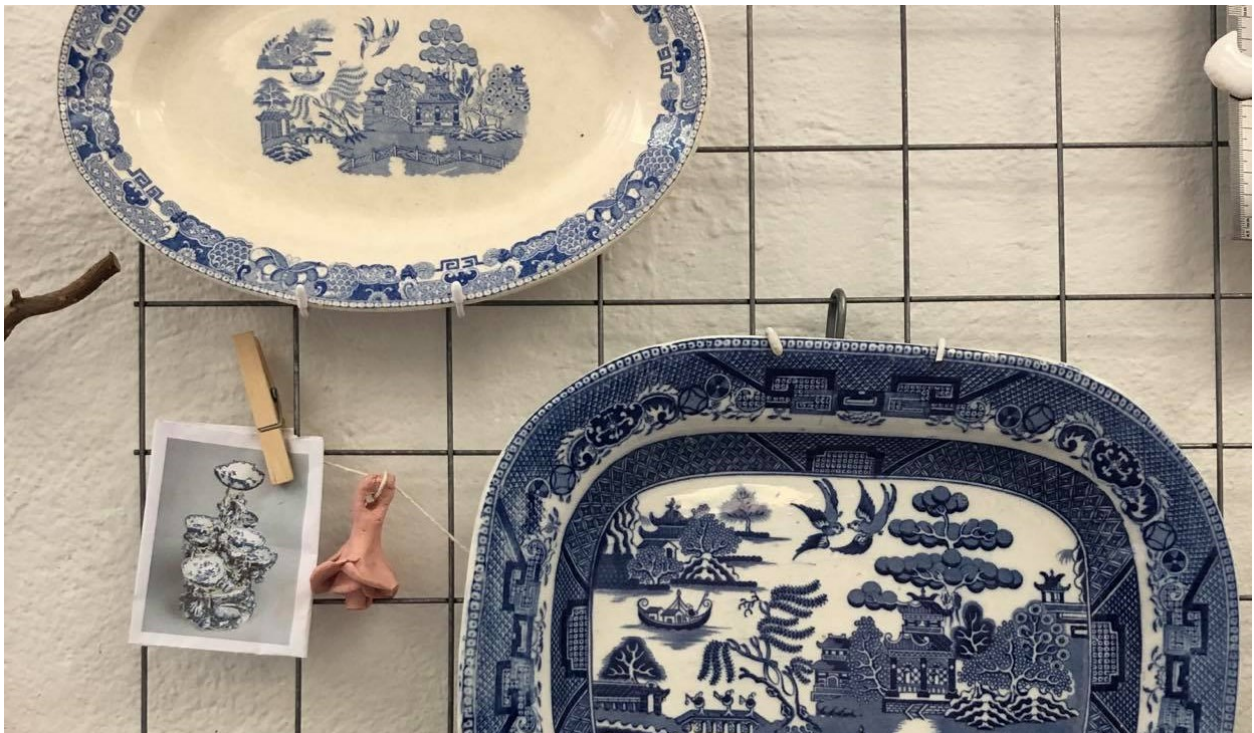
Figure 1. 'Blue Willow'. Traditional mass-produced blue and white ceramics.

from craft and handicraft-based processes. A conceptual approach in the project was to make ceramics in blue and white as a reflection on the theme; drawing lines, from the fourth industrial revolution of robotisation back to the first industrial revolution of mass production and industrialisation, where blue and white porcelain (Figure 1) was an example of the new mass-produced goods, transformed from being available exclusively to high society to being available to all, but was also an example of a development where handicraft was replaced by industrial processes.