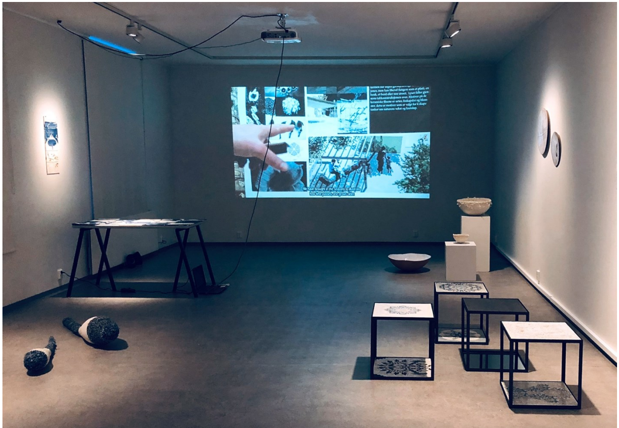
Figure 12. 'Blue Collar – White Collar'. Art installation with film, Craft 2018.

The four ceramic artists work with a common interest in the correlation between the 'return' of the craft and the fact that a robotised workforce makes manual work outdated. The artists work directly with the traditional blue and white ceramics to draw parallels between today's discussion and the first industrial revolution, where the arts and crafts movement formed a counterforce to industrialisation. The filmmaker has followed the four artists for more than a year and has made a great short film, where we get insight into thoughts and reflections about making, immediately as we can see just that: making. I find that the art group's mini exhibit room installation has a form of thematic superstructure and dissemination that could be a very interesting starting point for everyone in an annual exhibition of crafts. (Steinsvåg, 2018)