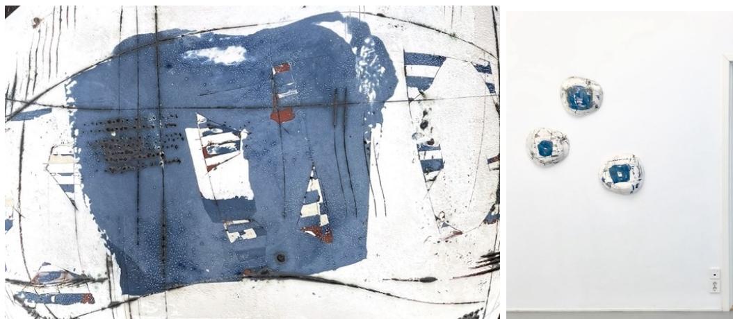
Figure 13. ‘A new language’ detail (Berg, 2022). left), Wall sculptures (right).

The Blue Collar – White Collar project had an exhibition ‘Out of the Blue’ in 2022 in the project room at the gallery Format in Oslo 15 . The gallery’s goal is to challenge established norms while highlighting key values in the field by actively bringing a wider spectrum of artistic practices in material-based art to the fore. Like a symphony that can be played several times, Blue Collar – White Collar theme about robotization and craft has shown to be relevant at both regional and international exhibition spaces for several years since the start in 2017. A conceptual framework for the project has been to work with blue and white colors, as this has deep roots in the history of ceramics. The artworks and texts at the ‘Out of the Blue’ exhibition reflect a development since the start.