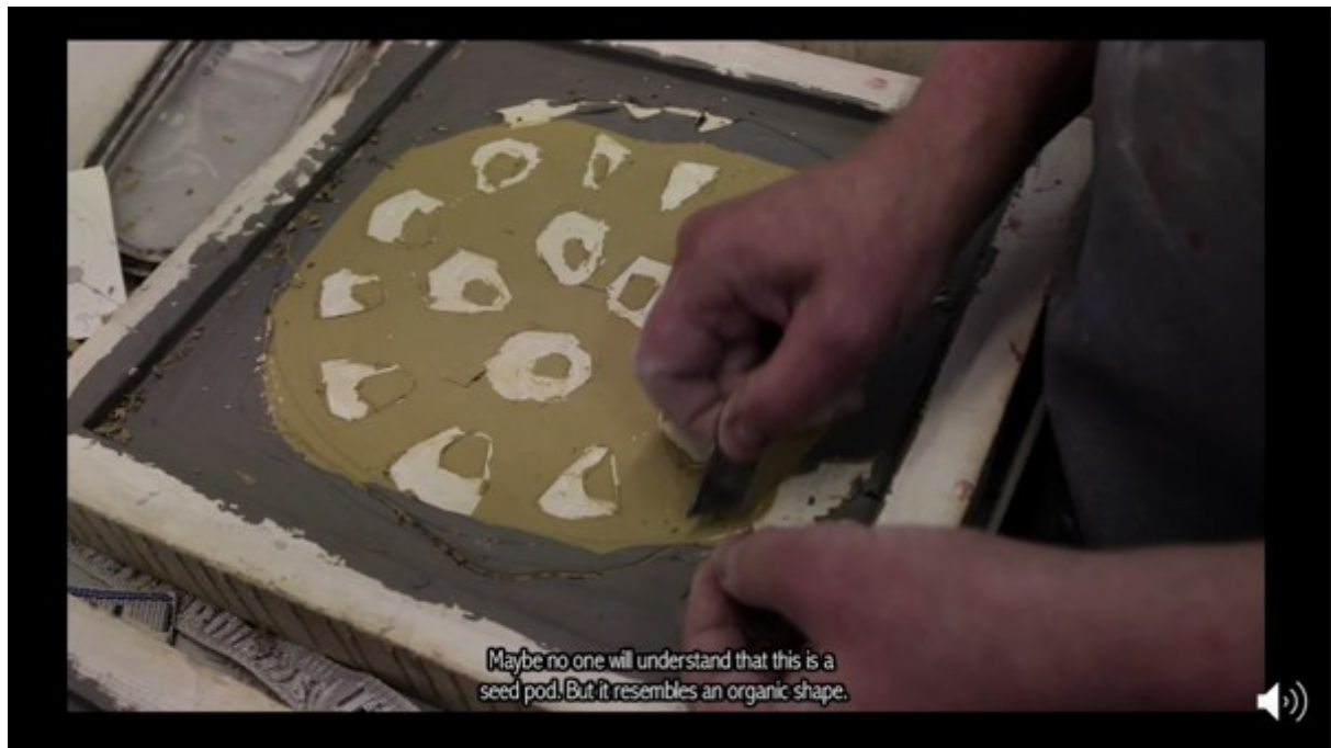
Figure 3. 'She documented the way we worked in practice. She asked questions about our feelings and thoughts during the creative process of making.'.

Some extracts and citations from the short film are illustrated below. Links to the short films about each artist are provided in the footnotes to the respective screenshots. First a citation from Arild Berg: