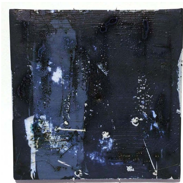
Figure 8. Blue Cosmos (2017), porcelain tile, by Arild Berg.