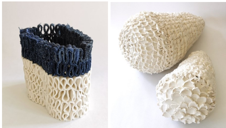
Figure 16. Little Blue Wave (left), White Creatures (right) (Swang, 2022).

Mimi Swang has combined porcelain/stoneware with different textiles, such as blue jeans and white shirts, used as symbols of the industrial- and the technological eras. What is the value of manual craftsmanship in the age of efficiency? Mimi Swang explores the possibilities of the materials in combination with traditional textile techniques. In her works she plays with the idea of the brain's ability to independently and spontaneously determine or change an overall plan during the process of creating, in contrast to automation of labor.