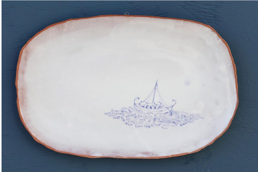
Figure 10. Blue Willow series/Boat and fishing rod (Lothe, 2020), from wall installation.

that have been crocheted in one or two different denim fabrics. The combination is unexpected, in a sense a free choice, and is also varied across ten different works. Clearly, her imagination sits in the front seat, even though the technical execution is of the highest class. (Figure 9) (Boel Ulfsdotter, 2017)