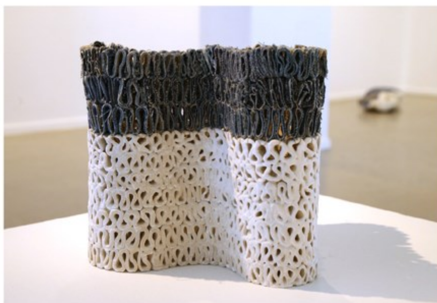
Figure 9. 'Blue Wave' (2017), stoneware ceramic, recycled blue jeans, by Mimi Swang.

[Mimi Swang's] bold combination of denim fabrics combined with porcelain clay is exciting and innovative. She has worked with simple, both cylindrical and wave-shaped vessel walls