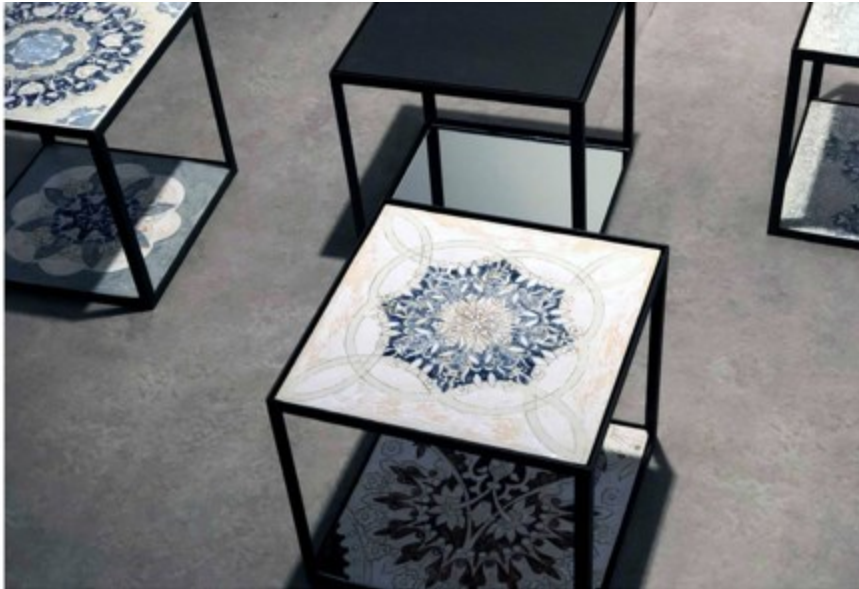
Figure 7. 'Movement' (2018), objects in porcelain and steel, by Elise Kielland.

In this case study the sources of information come from other perspectives on the artworks. Some of the results of the projects are shown here, with comments from art critics.