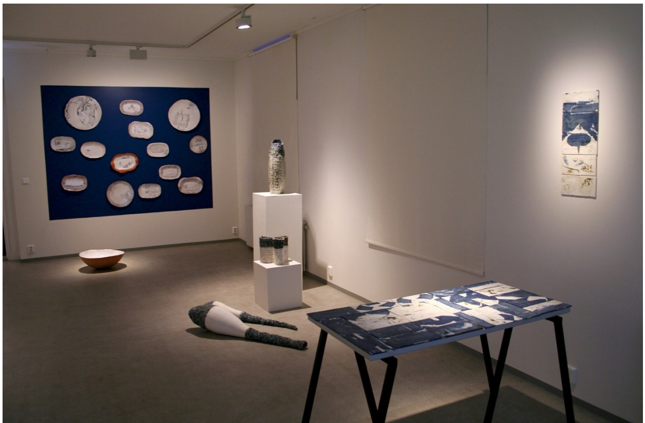
Figure 11. Installation 'Blue Collar – White Collar', Craft 2018.

The art critic Gjertrud Steinsvåg wrote about the room installation 'Blue Collar – White Collar' (Steinsvåg, 2018), with art objects and the short film included, at the annual craft exhibition in Norway in 2018 (Reiten & Holt, 2018): She wrote that despite many fine contributions, there were two works that made her pulse race a bit faster than normal: one of them was the project 'Blue Collar – White Collar' (Figures 11, 12):