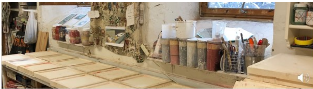
Figure 2. From the ceramic studio in the basement in the filmmakers apartment building.