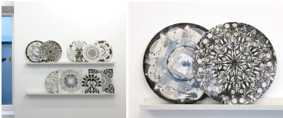
Figure 14. As long as it takes (Kielland, 2022) wall installation (left), detail (right).

drawing parallels to ceramic traditions. The motifs are for the most part stylized elements from nature put together in a rhythmic, ornamental expression. Her work unfolds manually over time, subject to something uncontrollable. Time is needed to make the most of the unexpected. Time to make room for the unexpected and time to do the right thing at the right time.