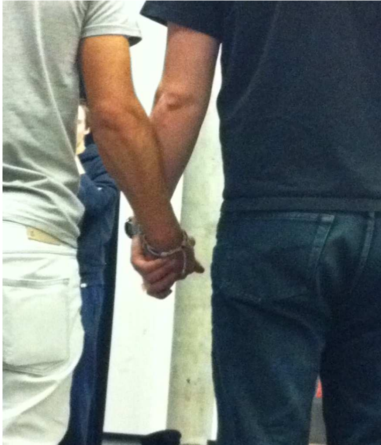
From the SFT process.