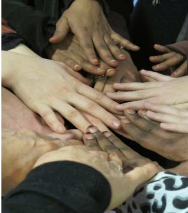
From the SFT process.

In SFT, we observed concentration and focus both on stage and among the spectators. The spectators were listening and there was silence during Aisha's Forum play. This incited a strong sense of community spirit and solidarity. The transition from passive spectator to active participant got a collective and unifying dimension as the spect-actor took on the leading role on stage and tested out changes in order to stop oppression. Those who shouted, "Stop" and entered the stage were given the full support of the spectators, through applause and verbal cheering. The "stop" and the interaction during the 6 th phase in SFT can be characterized as a collective act of rebellion, which contributes to a strengthened community and solidarity. "The kind of knowledge that becomes solidarity, becomes a 'being with'. In that context, the future is seen, not as inexorable, but as something that is constructed by people engaged together in life" (Freire, 1998, p.72).