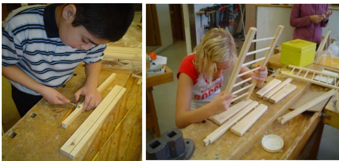
Figure 2: Young students at work in the classroom

The first integral national curriculum for compulsory education was published in 1960. It was gender-divided but emphasised the general pedagogical values of the subject. Based on the above law, a new national curriculum was published in 1976-1977 (Menntamálaráðuneytið, 1977). In this curriculum, 'Art and Handicraft' was established as a new area for craft education. This included art, textiles and craft. For the first time, all the subjects were compulsory for both boys and girls. This curriculum was slightly revised in 1989. In Iceland, Craft was re-established as a new technological subject in 1999, under the name Design and Craft (Menntamálaráðuneytið, 1999). The new subject was based on a rationale for technological literacy, innovation and design (Thorsteinsson, 2002; Thorsteinsson & Denton 2003). The present curriculum for Design and Craft, released in 2007, emphasised individualised learning and flexible instruction. Innovation and idea generation are an important part of the curriculum.