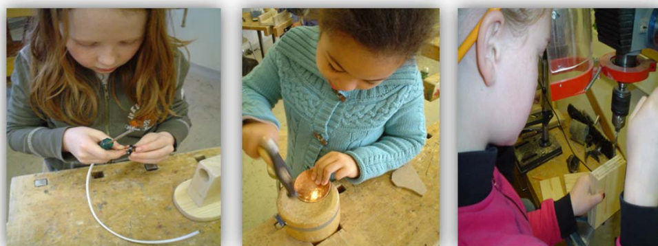
Figure 1: Young Icelandic students at work in the craft room

The subject of Craft was re-established as a new technological subject in 1999, under the name Design and Craft (Menntamálaráðuneytið, 1999). The new subject Design and Craft was based on a rationale for technological literacy, innovation and design. It became compulsory for grades 1–8, but optional for grades 9–10. The main aim was to develop technological literacy and idea generation skills in students (Thorsteinsson, 2002; Thorsteinsson & Denton, 2003; Olafsson & Thorsteinsson, 2009). The infrastructure (see figure 1) of Design and Craft was influenced by the national curriculum in New Zealand, Canada and England.