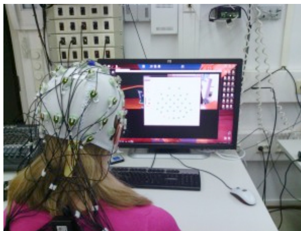
Figure 1. EEG equipment used in research on skill learning.

Figure 1 shows the research setting of the skill learning experiment. EEG measurements were performed before and after learning a specific textile craft skill. Electrodes were placed at various locations on participants' scalps to measure the voltage of synchronous electrical activity of neurons at those locations. During measurements, participants' brain responses were recorded using a NeurOne EEG-instrument (Mega Electronics Ltd, Finland) with 32 EEG and EOG channels. The EEG procedure enables illustrating brain activity during real-time viewing and action and is non-invasive and much less cumbersome than other brain imaging systems.