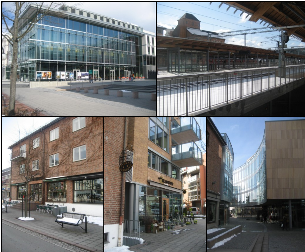
Figure 2. Urban forms and architecture in the minicity of Asker (photos: Per Gunnar Røe).

Both Asker and Sandvika were once centres in rural areas that have gradually been suburbanized over the past 50-70 years. It is a common trait that their urban morphology, structure and architecture have changed from those of a small town, characterized by public access roads organized in a street pattern and with relatively small buildings, often with a single shop on the ground floor level. Today, this small-town character has been radically changed, and the minicities are characterized by large building volumes resembling an urban structure, and architectural facades which give a sense of urbanism (see Figures 2 and 3). One project in Asker won a national architectural prize for good urban architecture (Figure 2, bottom right picture). Over the past 10-15 years, urban apartments in houses with 4-6 floors have been built. Both minicities have a major shopping centre and cultural amenities, with cinemas, libraries, theatres, etc., coupled with public space access for pedestrians. The building complexes are organized so as to create a sense of street and square. But equally important are the inner “streets” of the shopping centres, which provide competition to, but also an extension of, the outer public streets and public spaces.