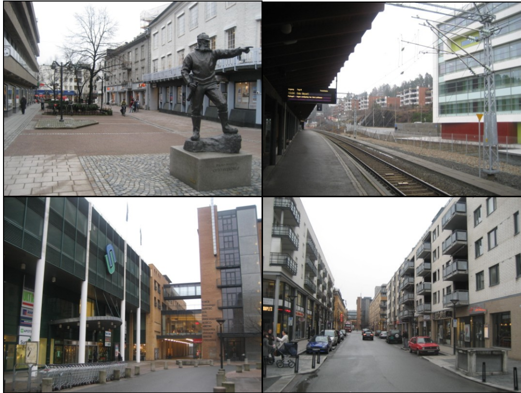
Figure 3. Urban forms and architecture in the minicity of Sandvika.

Thus the minicities are a mix of open accessible streets as well as a large proportion of private, commercial indoor spaces, which are controlled and closed outside shopping hours. This shift towards inward-oriented shopping centres is a development that also can be observed in the big centre. Nevertheless, this tendency is more pronounced in minicities such as Sandvika and Asker, simply because the shopping centres have a large proportion of all shops and services.