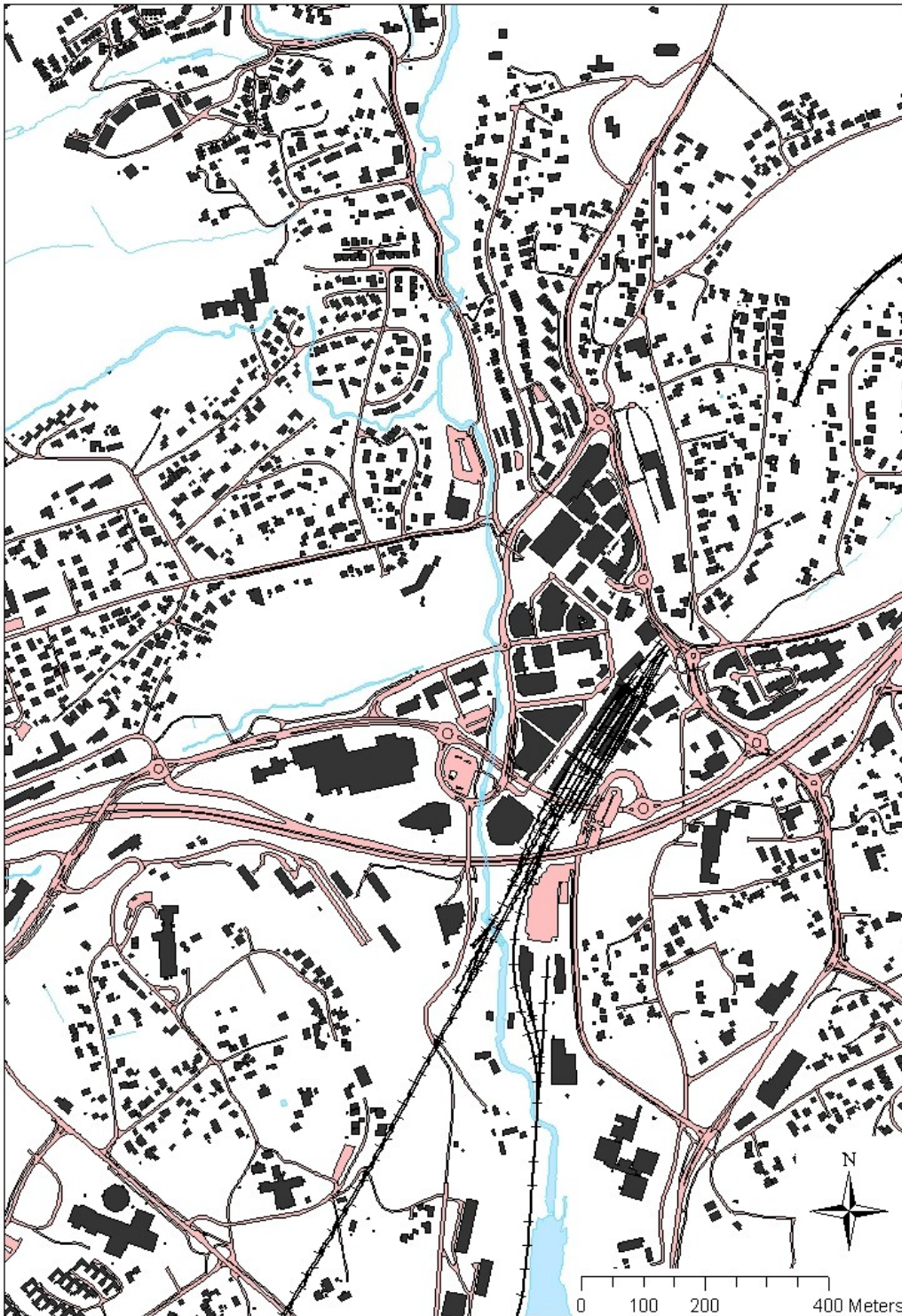
Figure 4. Map of the minicity of Asker, showing buildings, roads and railway lines (Data source: Norwegian Mapping and Cadastre Authority).