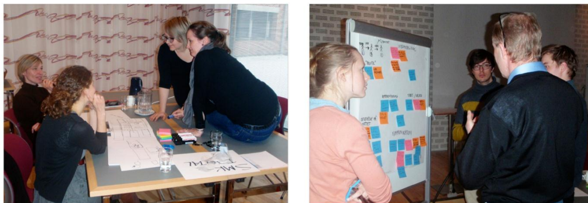
Figure 1. Students working with representatives from the companies at the workshop, using visual mapping and concept development to make sense of the vast amount of user data.