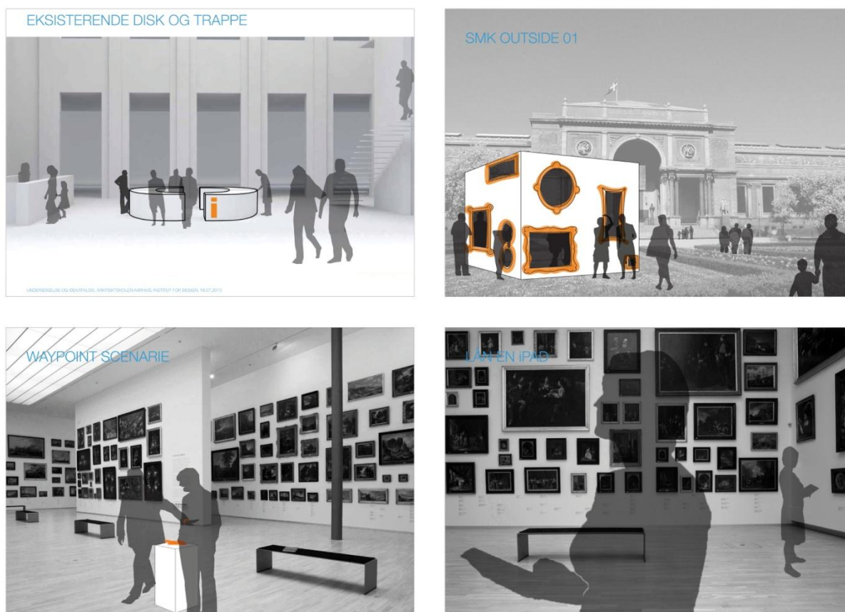
Figure 4. Examples of the students' conceptual proposals. The concepts created specific common references that the entire organisation of the museum could base their discussion upon.

The analysis of the first-time visitor's experience of the entrance hall, presented in a form which combined both images and statements, led to both recognition and surprise among the employees. However, it was the specific concepts for change that really got the discussion started. Through the visual proposal the employees got a common reference point to discuss, and they could explore the concepts' impact on their own field of work. Thus, it was suddenly simpler to understand if some aspect of the current structure and organisation actually prevented such a possibility for change. A senior official from the organisation described the presentation as "convincing and thought-provoking" and gave the following evaluation of a visual delivery with specific concepts for change: "It means that the presentation is taken very seriously inside SMK, and has served as an impetus for meetings at the top-level and in other forums."