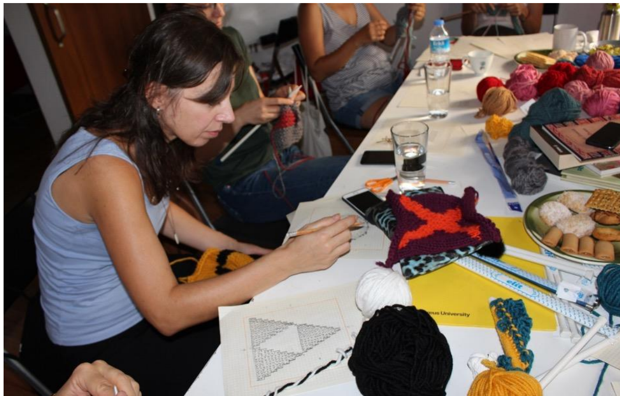
FIGURE 2. A paper with squares was used to create the motif and prepare it for knitting.

During the workshop, as the organizer, I also designed a motif and knitted with the participants. After the very first presentation about the motifs, I became a participant in the workshop. As a participating observer (Bernard, 2006), my knitting together with the participants also changed my role from the one who was in charge to being a peer . Changing my role to being a participant generated a more homogenous structure by removing the hierarchical role of the organizer. As I designed and knitted a