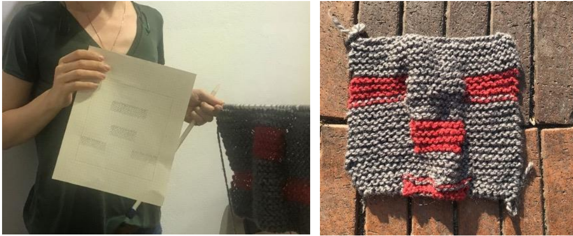
FIGURE 5. The human motif, to remind that being good or evil is a choice of humans.

being a human and human-centred mean. Her main reference point was the difference between human actions and humanist actions (Figure 5).