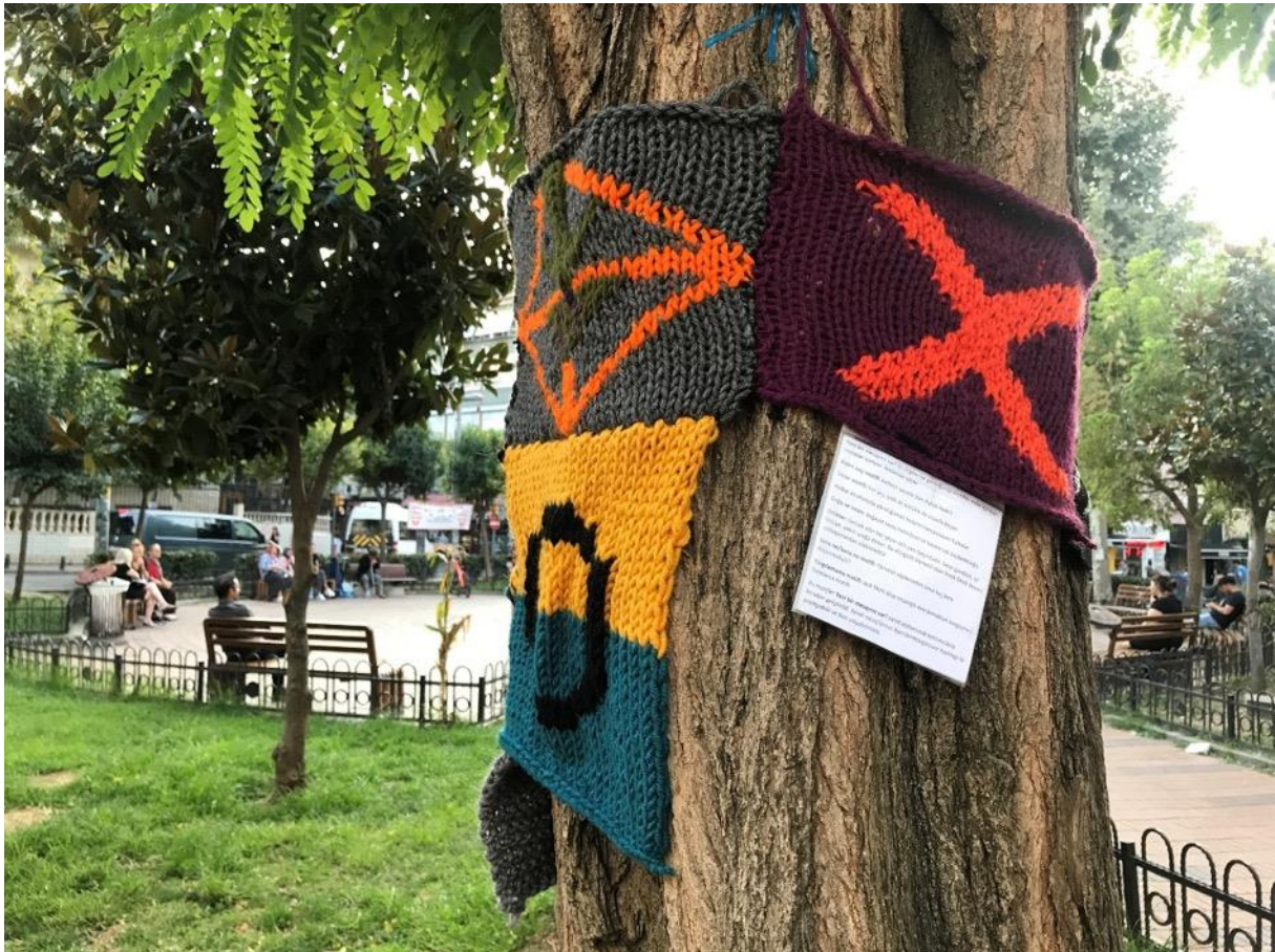
FIGURE 3. Several outcomes of the workshop.

piece, I was also making an example to the other participants through which we could discuss technical aspects as well. This was important since it gave an idea about what might be the outcome clarifying the expectations. Also, when I became a workshop participant, I could gain the insider's experience about, for instance, how to draw the motif, how long it might take or what might be challenging. Thus, I could facilitate their participation in richer ways. Yet, my role as a facilitator and helper continued during the workshop when someone needed support with their knits. I documented the process with photographs and recorded their voices during the final discussion, which was when everyone presented their ideas to each other. After the workshop, I also wrote a reflective text on the workshop.