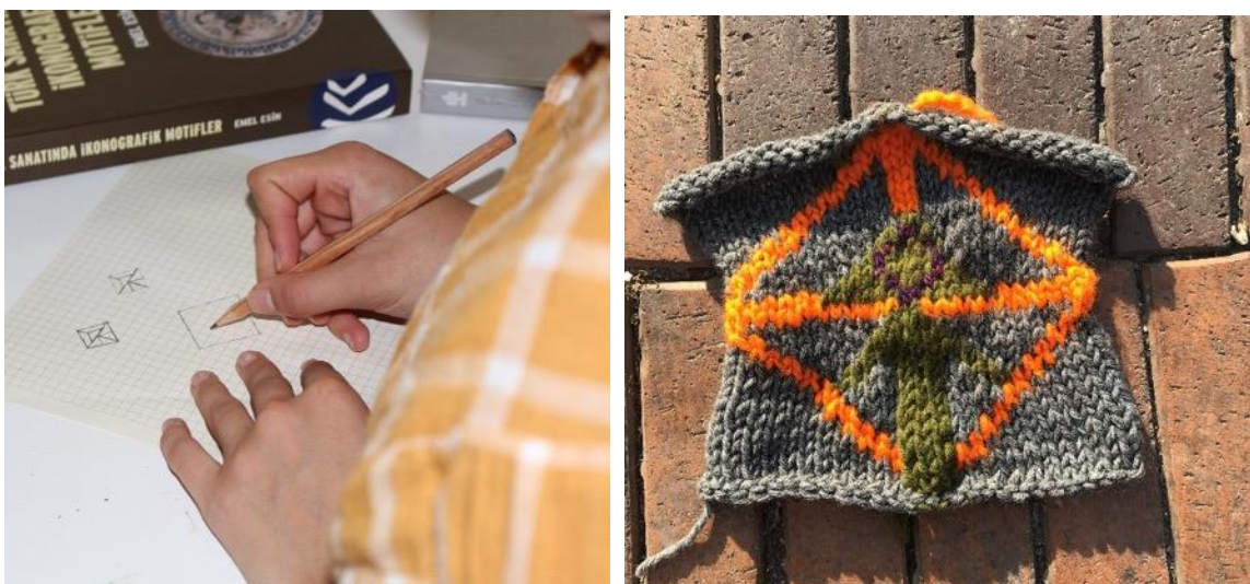
FIGURE 6. Human and nature motif: “We are in a war with nature. We will lose if we win”.

The last theme was about the environmental crisis and how humans relate to the environment mostly in reference to deforestation and bushfires. For instance, human and nature motif questioned the artificial distance between humans and nature, inspired by the idiom: we are in a war with nature, we will lose if we win . Drawing from the environmental crisis and continuing deforestation in the world, the participant who was a social worker pointed at the unity of humans and nature. By designing a motif based on a human in the form of a tree, she discussed how humans were not different from trees (Figure 6).