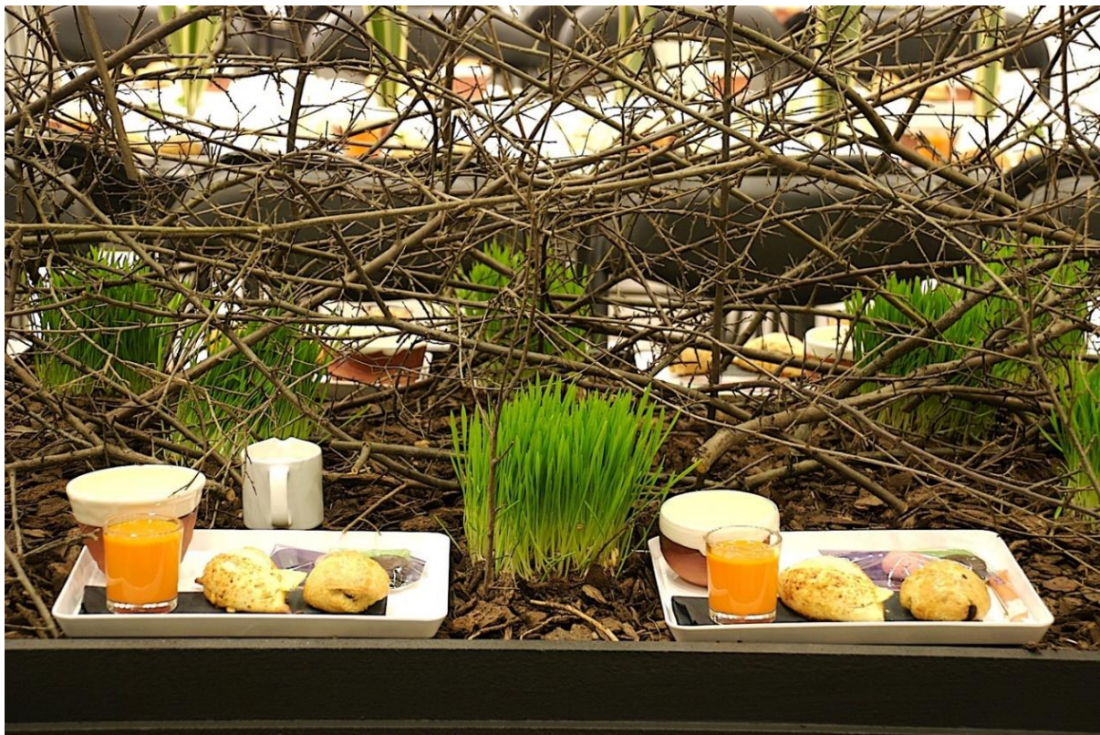
FIGURE 3. Table setting by breakfast bread, biscuits and twigs.