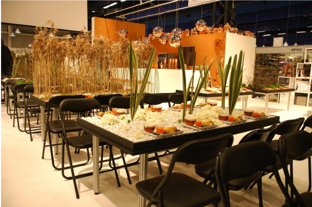
FIGURE 2. The decoration of the tables by reeds and Sansevieria trifasciata .