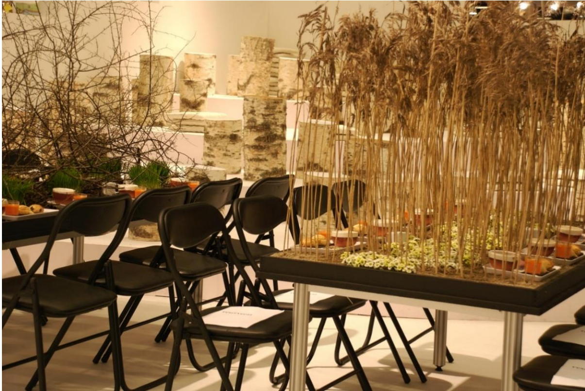
FIGURE 4. Table decoration with twigs and reeds.