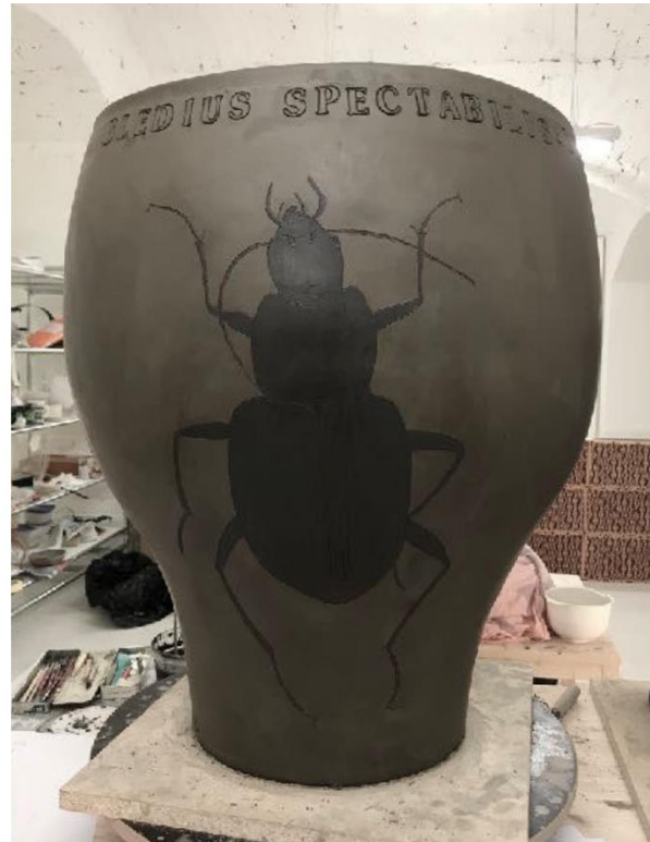
FIGURES 2 AND 3. Figure 2: Clay pit in Kultela (node 3). Figure 3: Ceramic vessel painted with motifs of critically endangered species (node 27).