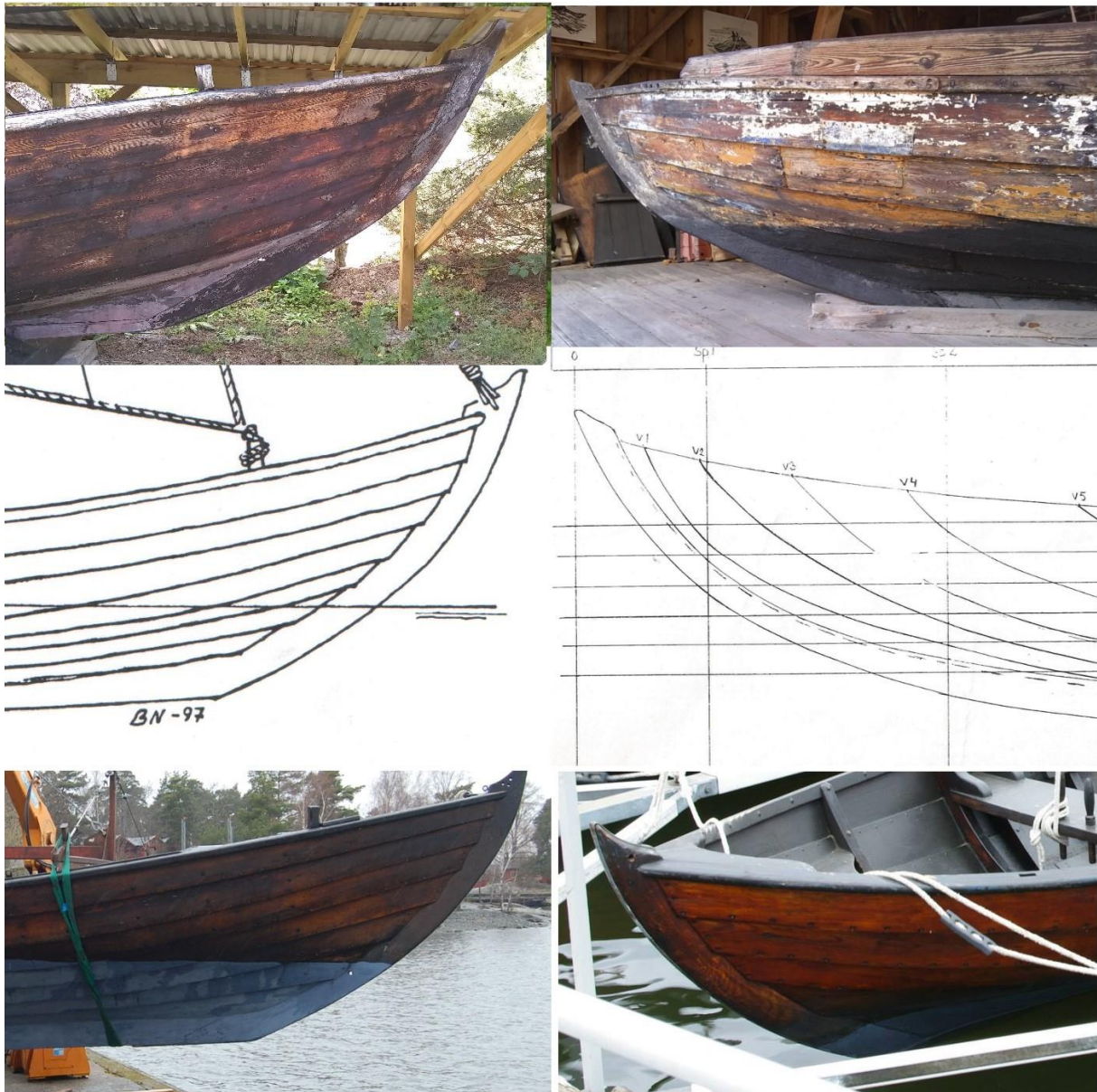
FIGURE 2. Original boats (top), documentations and well-built replicas. The shape of the sterns was smoothed in the documentations and replicas by professional boat builders.