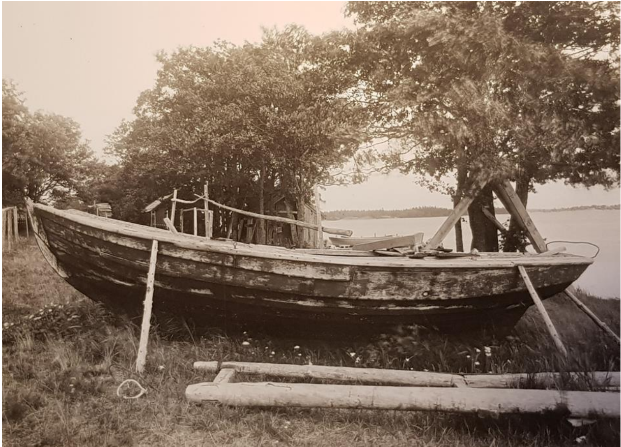
FIGURE 1. An old Storöka , the island Tjockö, Stockholm archipelago 1928. The Nordic Museum archives, Kustundersökningen.

planking in the lower parts of the hull; this means that the boat builder had to split and sculpture spiral-grown logs into a twisted shape, mainly using an axe (Hasslöf, 1953; Törnroos, 1968). This was a labour-intensive way to build boats, but the result was that the boats performed very well under sail. In the early 20th century, the tradition of building these boats was broken with the advent of the use of motors in boats and the widespread use of sawn, steam-bent planking in boat building. Today, there are no living tradition bearers, and we are left only with the boats as evidence of the past craft. Even though this craft tradition has been lost only for a relatively short period of time, the problems of interpretation are similar to those in experimental archaeology.