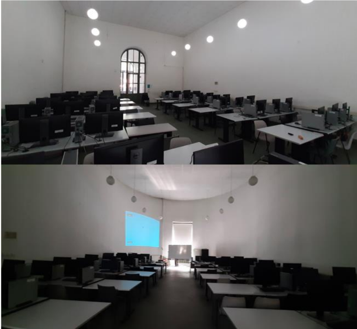
FIGURE 2. The computer lab used before the pandemic.