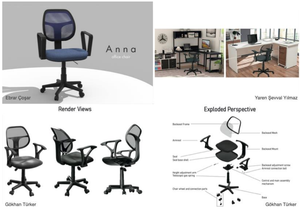
FIGURE 3. Some of the students' works as the final assignment (by the courtesy of students).