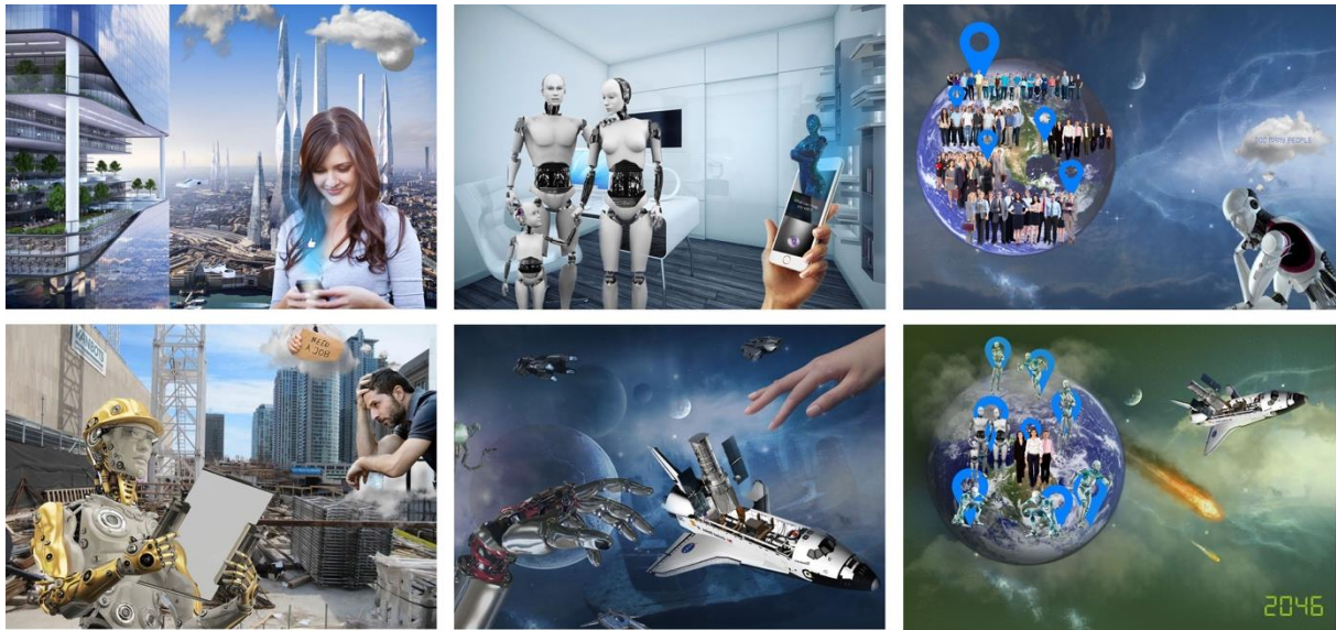
FIGURE 3. Media and communication. School project Media 2046. Student project work.