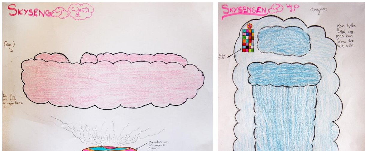
FIGURE 5. 7th grade student project work: Skyseng (English translation: Cloud Bed).

In reflecting on their work with future scenarios, many of the students described a joy of shaping the unknown. They identified problems and described new solutions (Ringvold, 2014). Nigel Cross (2011) argued that good designers have a special way of thinking: ‘Rather than solving merely “the problem as given” they apply their intelligence to the wider context and suggest imaginative apposite solutions that resolve conflicts and uncertainties’ (p. 136). This description of design thinking is comparable to the students’ project work. In their descriptions of the future, they identified problems of today and tomorrow, which they sought to solve with their design solutions. For example, one student designed a Cloud Bed (Figure 5), which is not only a hovering bed shaped as a cloud, but also part of photosynthesis. This problem-solving product emerged from the interdisciplinary research phase. The student work shows how interdisciplinarity in general design education can contribute to creative problem-solving. The use of future scenarios and speculative design can help develop human creativity and innovation. Through learning to see the bigger picture and products in a wider interdisciplinary context, students can develop problem-solving skills that support their research capabilities and creativity.