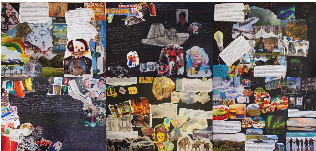
FIGURE 1: Six different future scenarios. Student collage presentations.

These student reflections of multiple stories and future possibilities indicate, in our view, insight into the complexity of reality and reflections regarding the multiple perspectives needed to understand reality.