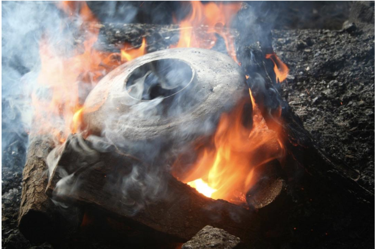
VIDEO 1. An audio-visual video with author reading the paper. (To watch the video, click the picture or the link : https://biccs.dh.gu.se/2023/8-2023/1 )