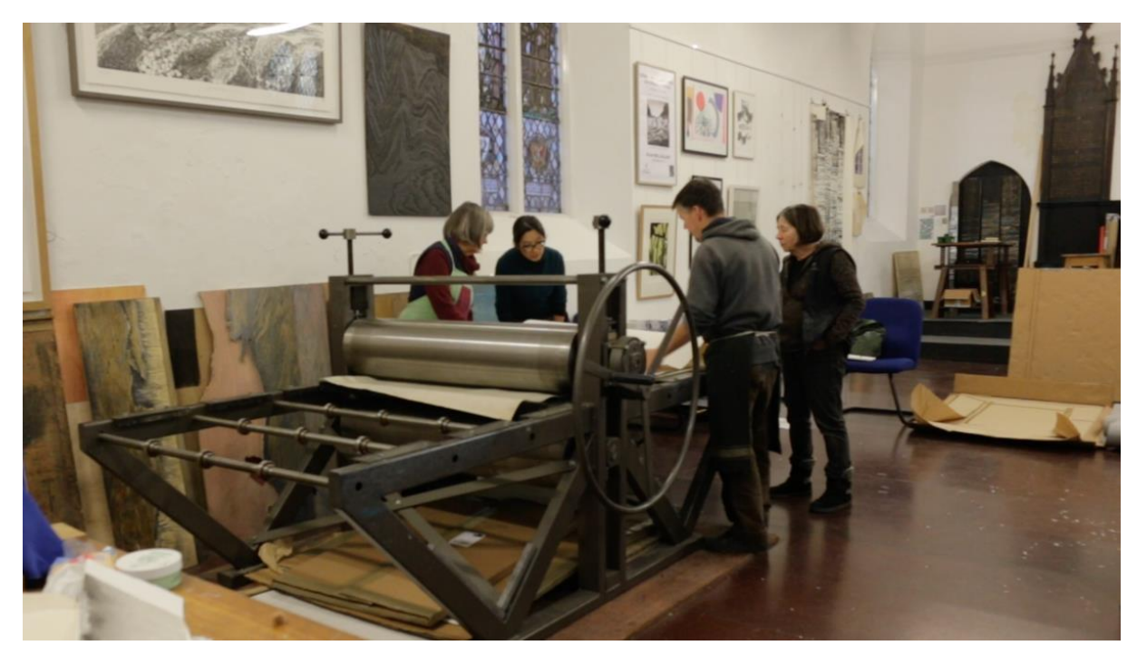
FIGURE 1. Members of Pine Feroda gathering around the press after making a print. Jan 2022.

because there was no press large enough for his blocks; Drive by Press (USA) in the 2010s who carve and print from the wooden bases of skateboards and print them with foam blankets; and most recently during lockdown: hardware shop wheels repurposed as rollers, boxes of tricks posted to students, zoom conversations about ink. As a result, the development of a new technique and the questing nature of trying to make it very robust and reliable is not outside of the normal working practice of a printmaking studio group.