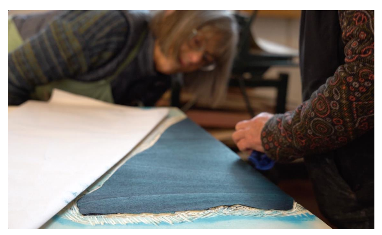
FIGURE 4. Checking the surface of the woodblock for sheen. Jan 2022

glance at the block with a shallow angle (achieved by lowering the head close to the block while keeping the eyes fixed on the look of the ink) to see if there was a sheen and whether it was completely covering the area that it should. If there was too much ink or oil, we commented on whether it was perhaps a little "wet" or "juicy". One artist described the movement of pushing ink into the woodblock as needing a "whirly action" which chimed with our haptic senses of touch and intentionality. I explained that the surface of the woodblock should be "fingertip dry", indicating that a tapped finger would not leave a puddle of moisture behind in its wake.