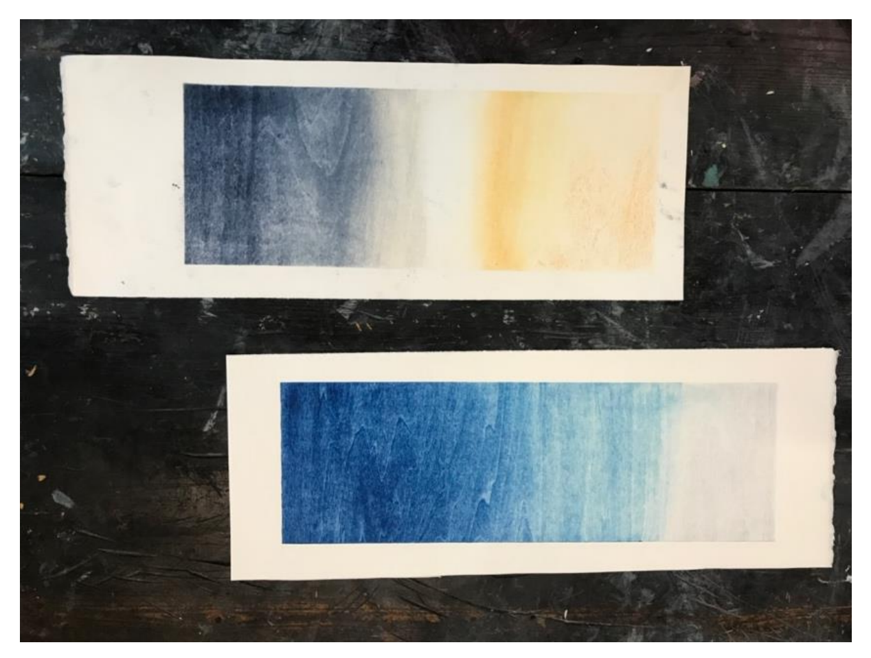
FIGURE 2. Test Print with a novel technique called Hartland Hanga. Jan 2022

Pine Feroda usually met every 6-8 weeks for a printing session involving all members staying in the same house and spending a focused period of 3.5 days' work in the studio each time. I joined them for four of these sessions in total. In order to balance subjective and objective knowledge, and further guided by Garfinkel's writing on ethnomethodology (Garfinkel, 1984) and Heath's textbook Video in Qualitative Research (Heath et al., 2010) I decided to use two cameras to capture moving image footage at key points in the studio. The data was kept for later analysis and reflection which was performed after the collaborative process had ended.