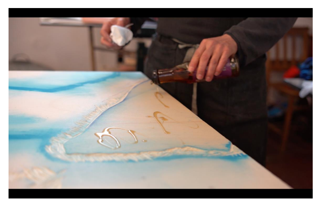
FIGURE 3. Drizzling oil onto the surface of the woodblock. Jan 2022