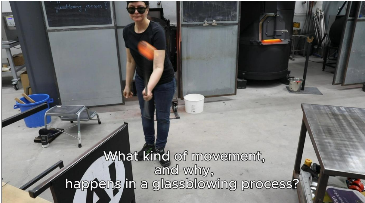
VIDEO 1. This video communicates what kind of movement happens in a glassblowing process.

The 1 min 22 sec-long video clip linked to this section of the article communicates, on a general level, what kind of movement we talk about in our study. The video shows how the glassblower moves in the studio set up between the glass furnace, the glassblowers' bench, and the mould-blowing station. In addition, it shows the movement of the hot glass (Video 1).