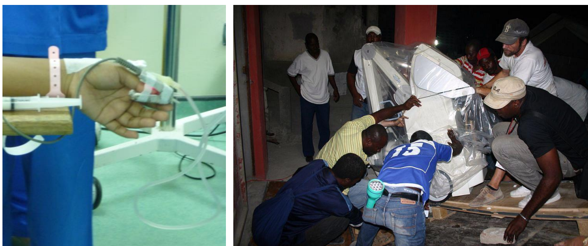
Figure 3 (a) Pulse oximetry in use with temporary fixing; (b) Transport of x-ray device.

An x-ray device (Figure 3b) is regularly required in natural disasters for victims of orthopaedic lesions caused by accidents, crushes or falls. After the initial needs assessment it is ordered, purchased and sent from Europe to the field where an international expert waits to provide training to local staff (Product-Service y). The device is held at harbour due to lack of communication and proper transportation means for the damaged roads caused by the natural disaster (Socio-Technical y) (Societal y'). The military is asked to lend resources to transport the device from the harbour to the hospital location (Socio-Technical y). At arrival, the device requires special facilities to function (i.e. shielding), which are not yet in place (Product-Technology y). Technical support documents (created by the organization itself) are often made to cope with the lack of expertise to safely install the device (Product-Service y). Furthermore, this device requires specialized continuous maintenance and tools after donation (Product-Service y') (Product-Technology y').