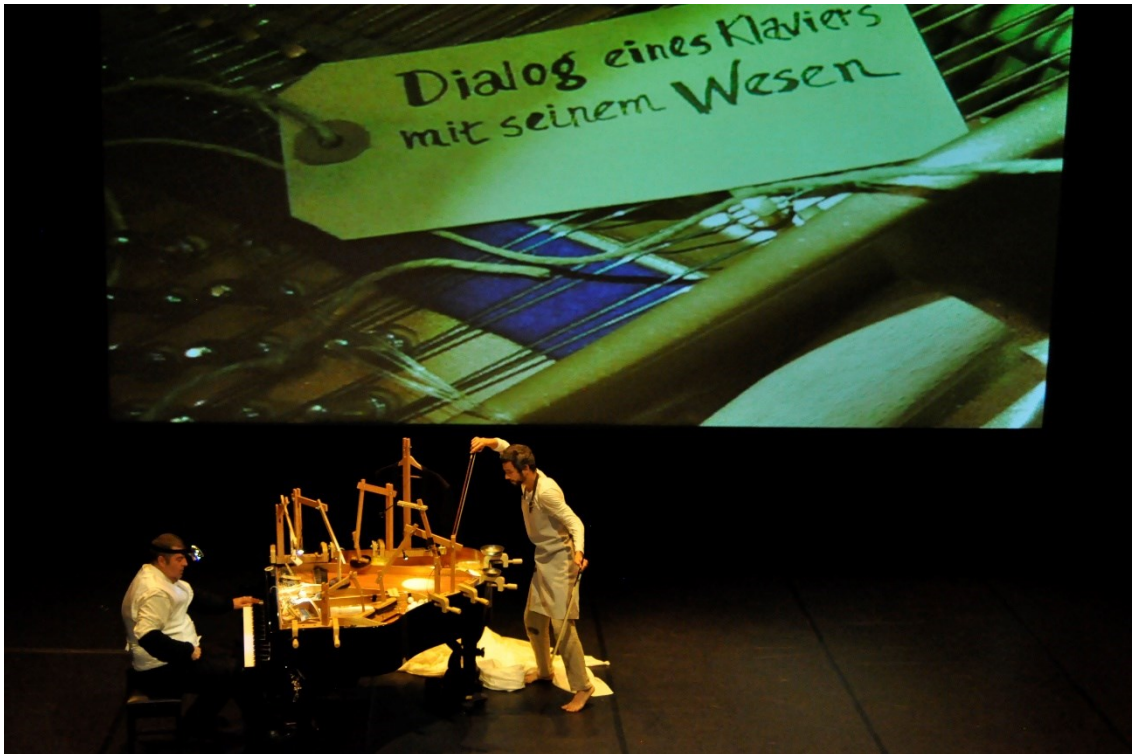
Figure 1. Still image from the Anatomia do Piano performance.

these observations that the performers noted curiosity and a desire for experimentation among the audience members. The desire to expand these experimentation spaces, which were aimed especially at children, led to the creation of Pianoscópio.