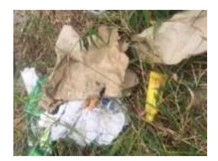
Figure 11. Debris

The chain on the art piece represents the literal chain on a fence surrounding an apartment complex that was unclear if it was to keep its residents inside or protect them from outsiders, to the figurative interpretation that the residents surrounding the areas do not have the financial means to leave their homes for the newer, remodeled apartments in view of their front porches (see Figure 12). The key to the padlock is on the newly painted white 'gentrified' side of the art piece to represent the fact that the fate of the individuals who are of lower socioeconomic status is in the hands of the people with the money and political power.