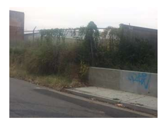
Figure 8. Stark Contrast

experience and have the opportunity to empathize with the emotions I felt as I conducted the walking research. The art piece I created to display the results of my data is symbolic of my emotions while conducting the walking research with my walking partners. I couldn't help but feel a mixture of sadness and indignation when observing first-hand the stark differences between the newly remodeled Crosstown Concourse building and its surrounding parking lot and grounds and the nearby blocks that make up the neighborhood and businesses (see Figure 8).