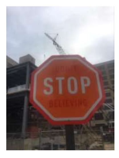
Figure 14. Don't Stop Believing