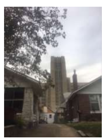
Figure 2. "Progress" in My Backyard