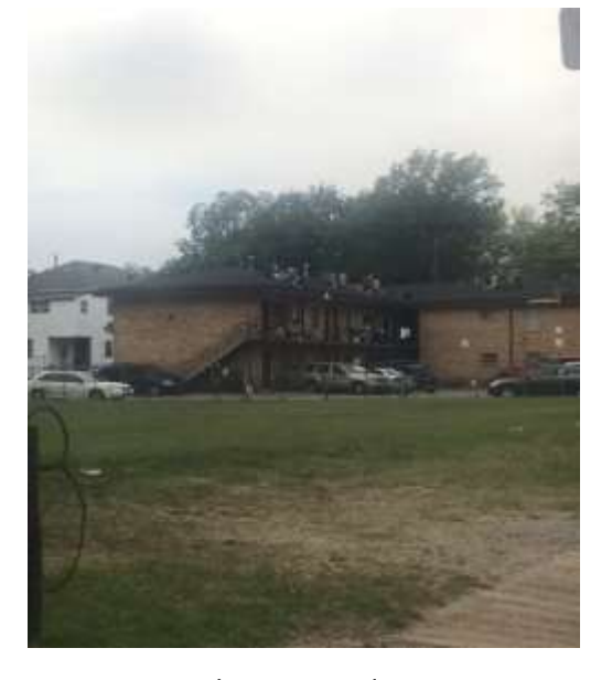
Figure 5. The Surrounding Scene 1