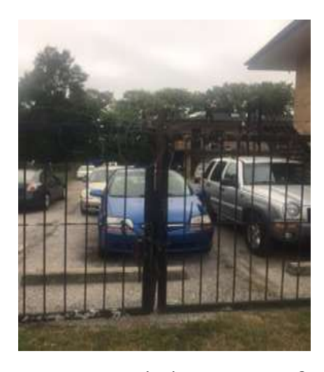
Figure 12. Locked In or Kept Out?

The chain on the art piece represents the literal chain on a fence surrounding an apartment complex that was unclear if it was to keep its residents inside or protect them from outsiders, to the figurative interpretation that the residents surrounding the areas do not have the financial means to leave their homes for the newer, remodeled apartments in view of their front porches (see Figure 12). The key to the padlock is on the newly painted white 'gentrified' side of the art piece to represent the fact that the fate of the individuals who are of lower socioeconomic status is in the hands of the people with the money and political power.