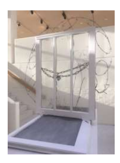
Figure 9. Intention: Interconnection via Intersectionality

My art piece, Intention: Interconnection via Intersectionality (see Figure 9), is a visual representation of the dual nature of the relationship between the Crosstown Concourse building and grounds that have been newly renovated, with fresh, smooth concrete making up the sidewalks that directly surround it so that visitors will be able to navigate the area easily (see Figure 9. There is an abrupt change in the sidewalk at the edge of the grounds leading into the surrounding neighborhoods that is impassible and unwelcoming for pedestrians, to the point that we had to walk in the street and watch for cars to ambulate from the Crosstown property to the neighborhood directly beside and behind it.