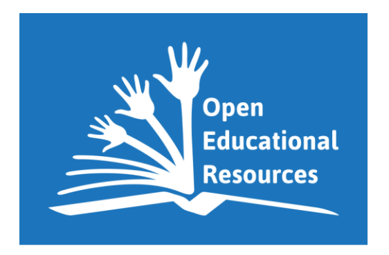
Figure 1: Global Open Educational Resources Logo<sup>xii</sup>

[...]The recommended definition of Open Educational Resources is: The open provision of educational resources, enabled by information and communication technologies, for consultation, use and adaptation by a community of users for non-commercial purposes. (UNESCO, 2002, p. 24)