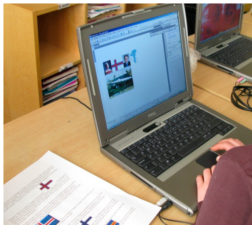
Figure 2: Digital stories about the Nordic countries.

The assignment was to find and present facts about the Nordic countries (Figure 2). The pupils were required to write a manuscript, save it on the Learning Management System, download still pictures and texts and use PhotoStory to combine textual information with still pictures. Using PowerPoint, microphones and headsets, they were then to present their stories to the rest of the class. Each production was to contain the following elements: name of country, flags, capital, government, population, famous citizens, landmarks and famous food dishes. The pupils had decided themselves to work with the geography curriculum. The DSP was carried out in the classroom, which was a noisy experience owing to lack of space and the layout of the computers lined up along the walls. The pupils had access to a computer each while working in groups of two or three. They had been given a brief introduction to PhotoStory and were familiar with computers, search engines, and the learning management system at school.